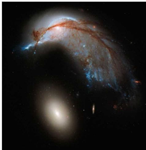
Penguin and Egg galaxies, photo by NASA, ESA and HST